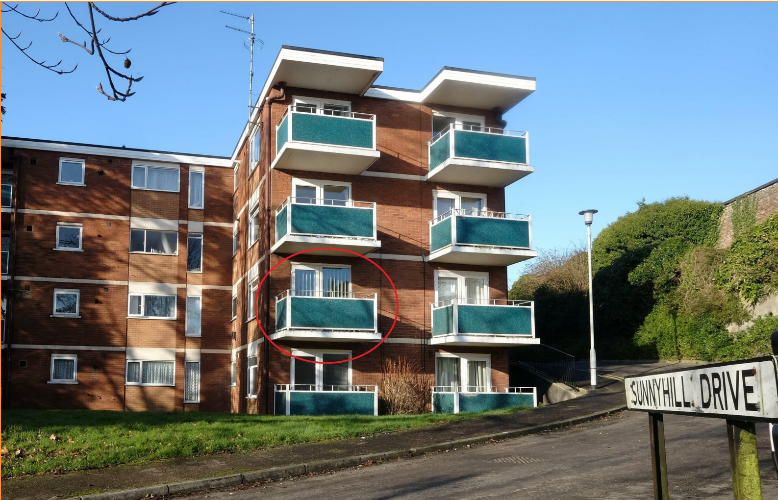
Flat 7, Sunnyhill House East Sunnyhill Drive, Shirehampton, Bristol, BS11 0UQ